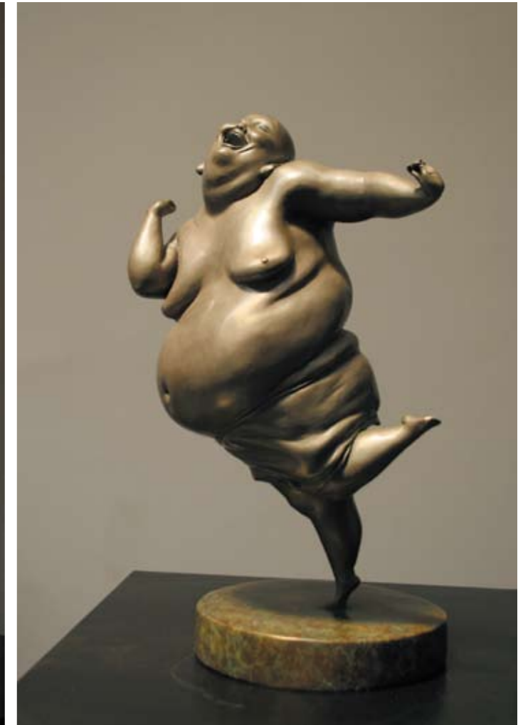
Random 2008 · Bronze · 54x30x25 cm