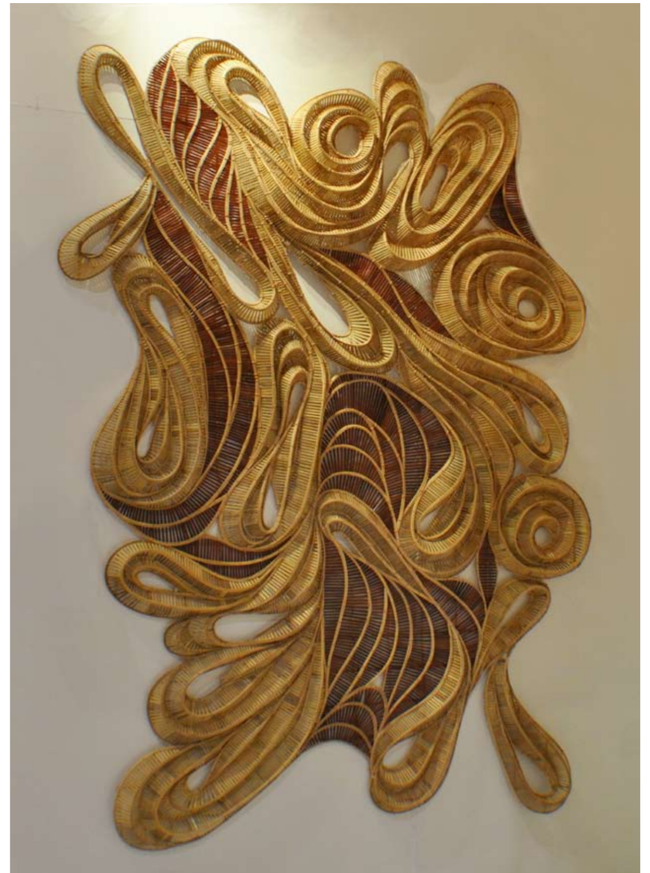
Untitled 2010 · Weaved Bamboo · 100x90 cm