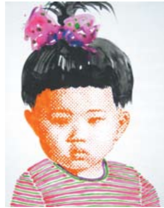
Kaleidoscope childhood #30 2010 · Oil on Canvas · 71x56 cm

Art Bank / ANZ Bank / Deakin University Collection, Melbourne / Pacific Asia Museum, Los Angeles / Hawkesbury One Art Group Collection, Sydney Private collections, Australia, Hong Kong, Singapore, USA and UK