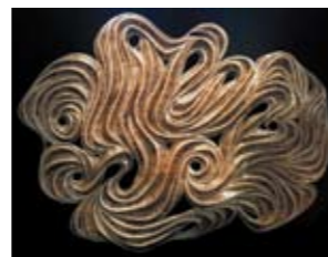
Untitled 2010 · Weaved Bamboo · 100x150 cm