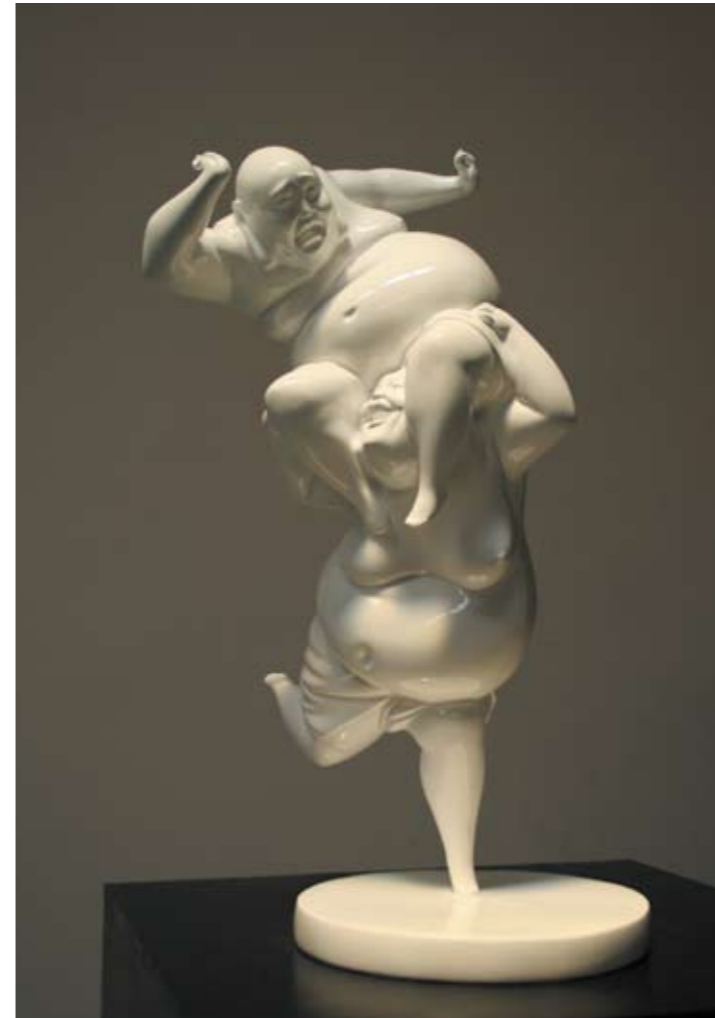
Twist in Fact 2008 · Bronze · 70x35x30 cm