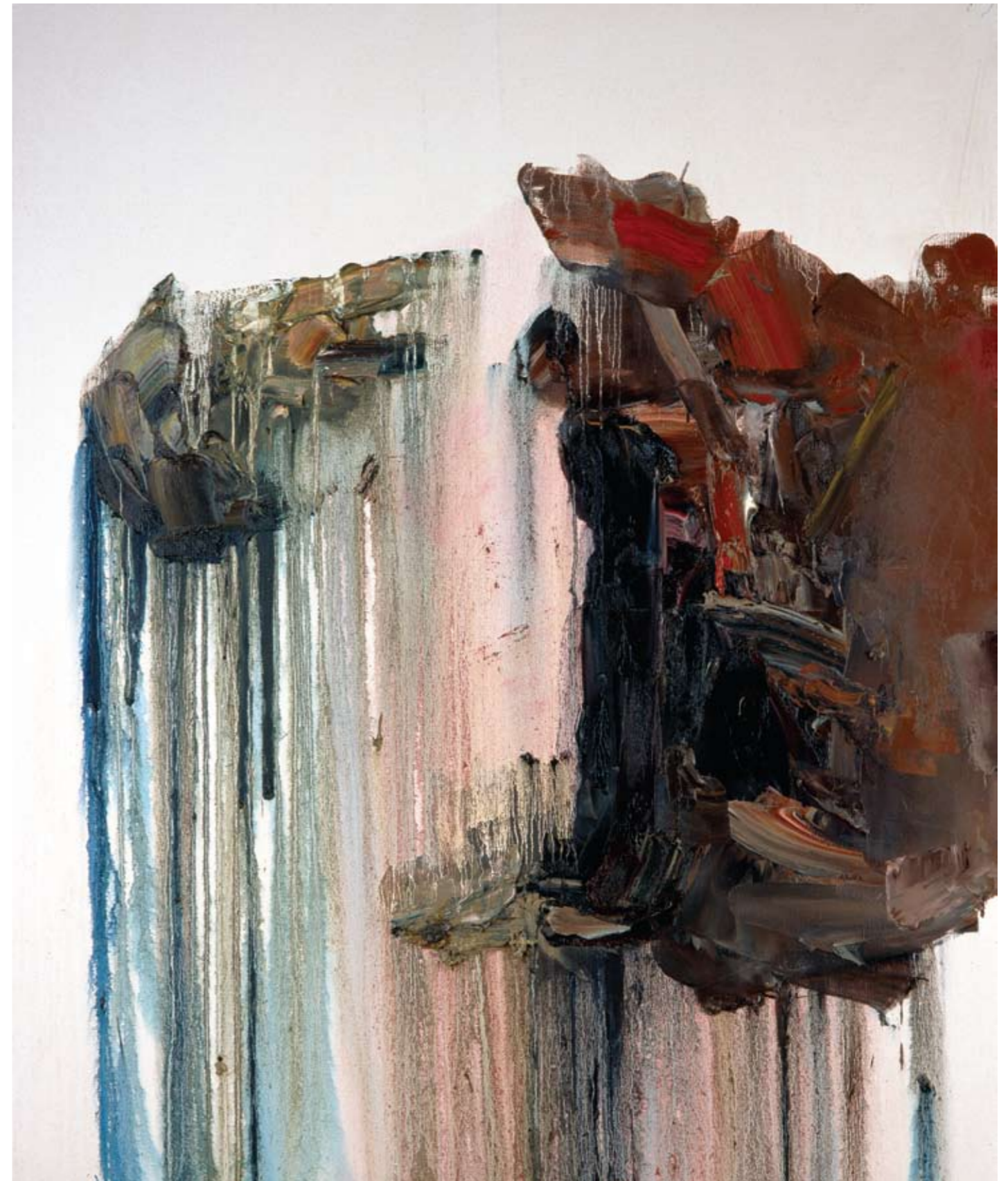
Dalia Lama Morning Pray 2008 · Oil on Canvas · 180x150 cm