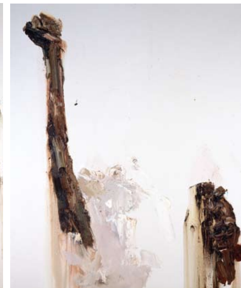
Chen Ping, Protestors , 2008, oil on canvas, 180 x 150 cm