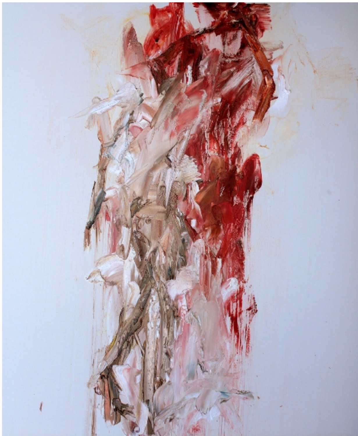
2011 Passage from White to Red Oil on canvas 153 w x 183 h cm