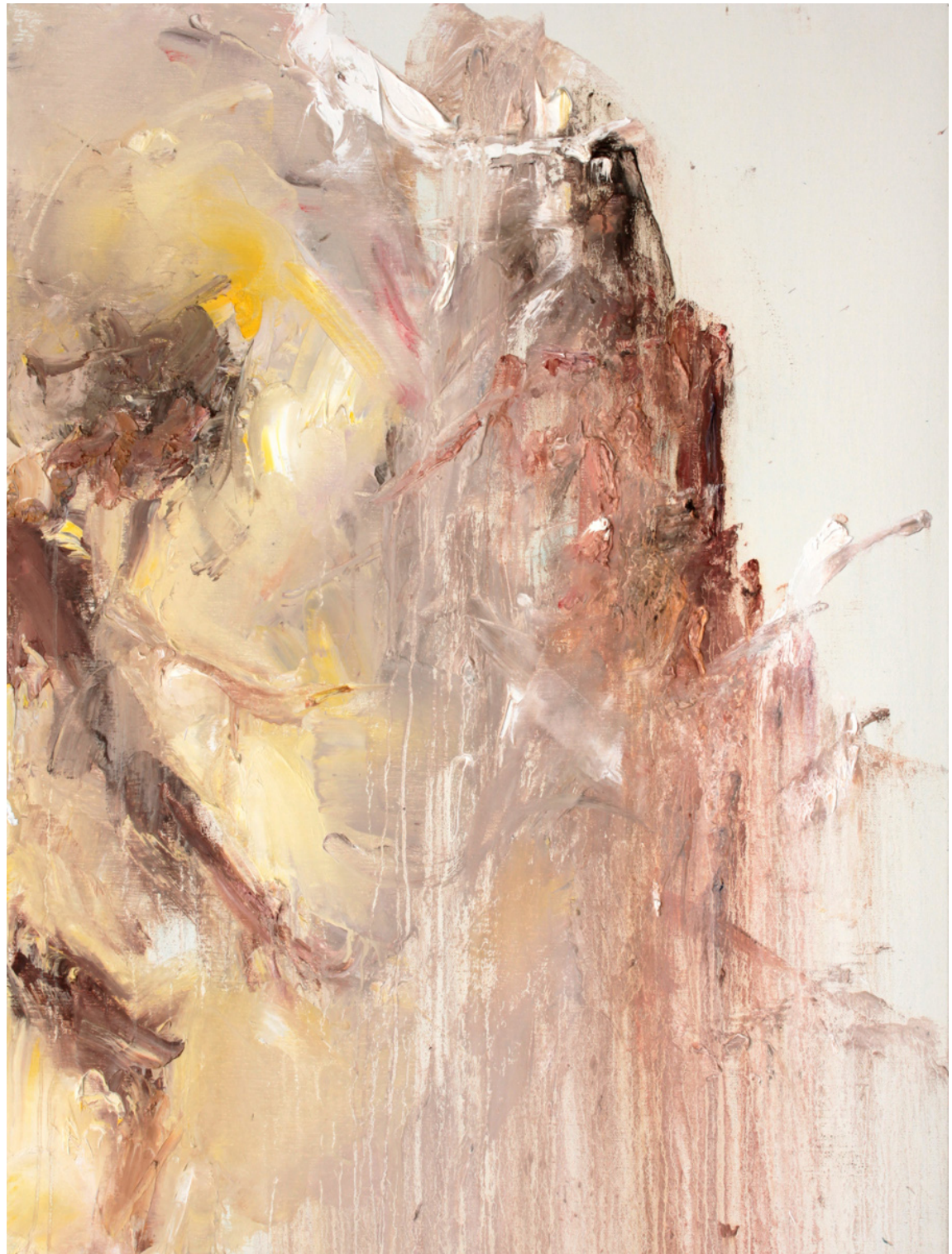
2010 Illusive #2 Oil on canvas 92 w x 122 h cm