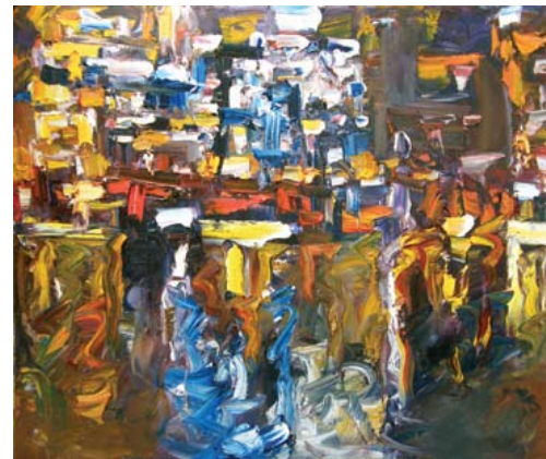
Chen Ping, Night 4 , 2009, oil on canvas, 150 x 180 cm.

The "chaotic (or at least seemingly chaotic) abstraction," Timms notes, into which Chen's works "collapse", is a rich one indeed. Within this "chaos" there are "lots of contrasts... the abstract elements dispute the realistic elements; the existence of art's traditional technical values have been under threat by the contemporary tendency," says Chen. "Individual incidents generalize human fate, the emptiness of the background overpowers the figurative subjects, the complexity of idea is expressed through a simple form of narrative, and the colors struggle between being emotional or realistic."