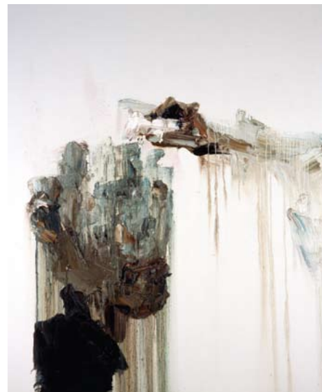
Chen Ping, Injured Man , 2008, oil on canvas, 180 x 190 cm.