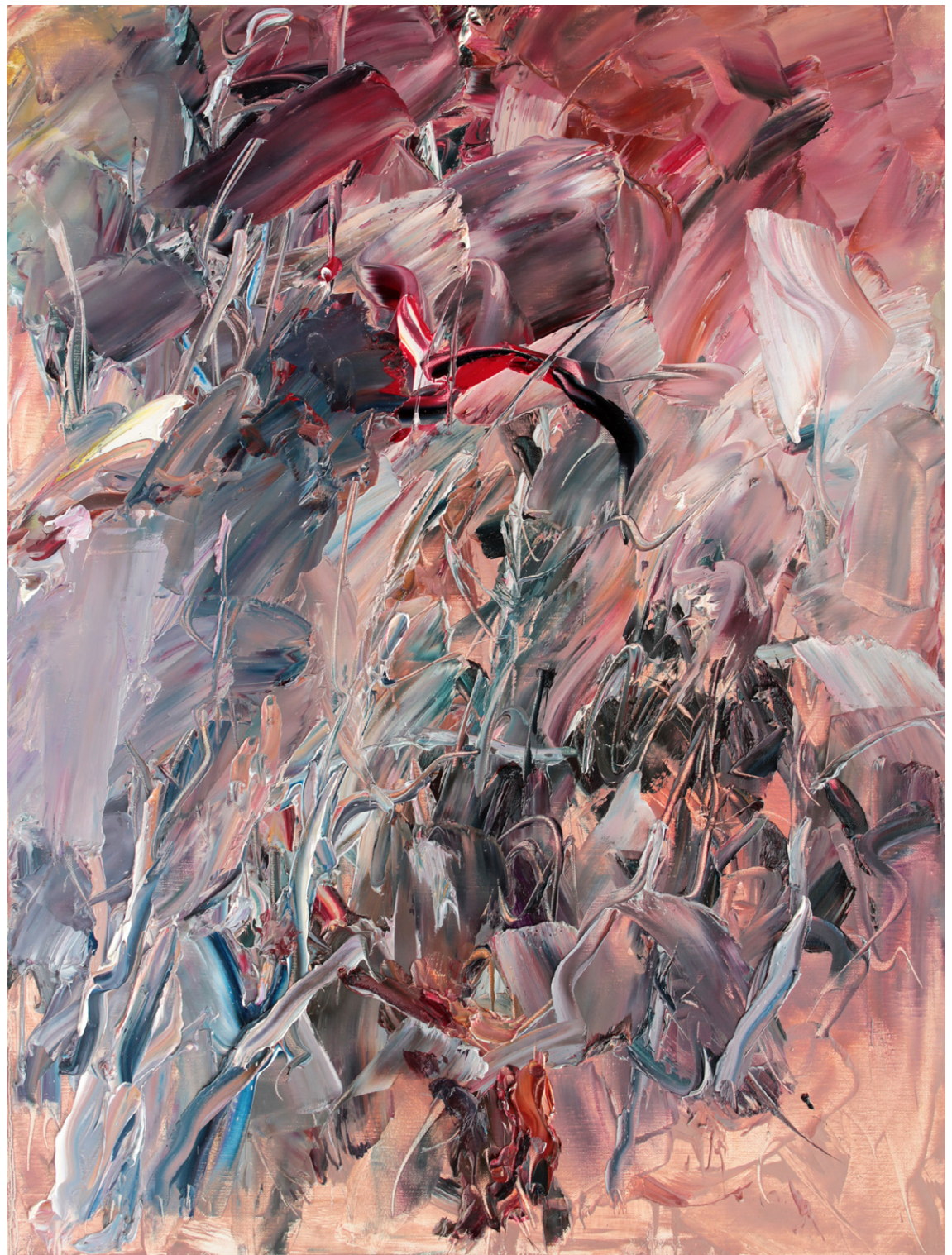
2012 Storm, Forest, Red Bird, Man Oil on canvas 92.5 w x 122.8 h cm