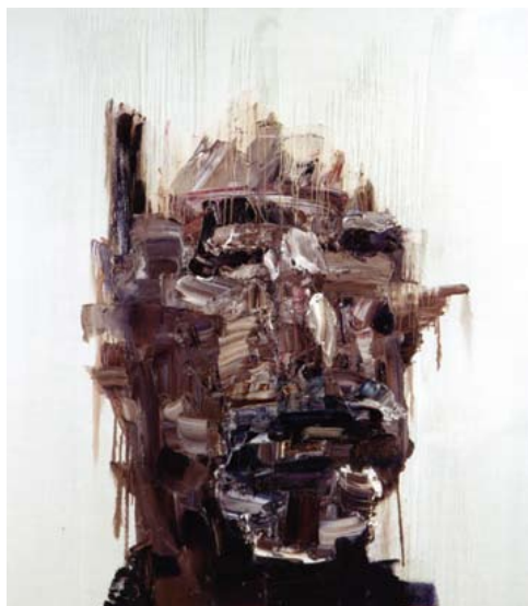
Chen Ping, Big Flood 1 , 2007, oil on canvas, 210 x 180 cm.

The "chaotic (or at least seemingly chaotic) abstraction," Timms notes, into which Chen's works "collapse", is a rich one indeed. Within this "chaos" there are "lots of contrasts... the abstract elements dispute the realistic elements; the existence of art's traditional technical values have been under threat by the contemporary tendency," says Chen. "Individual incidents generalize human fate, the emptiness of the background overpowers the figurative subjects, the complexity of idea is expressed through a simple form of narrative, and the colors struggle between being emotional or realistic."