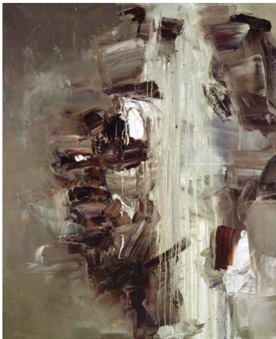
Chen Ping, Sudanese Refugee with Broken Head , 2007, oil on canvas, 180 x 150 cm.

The spontaneity that one sees in works such as Refugee with Broken Head (2007) and