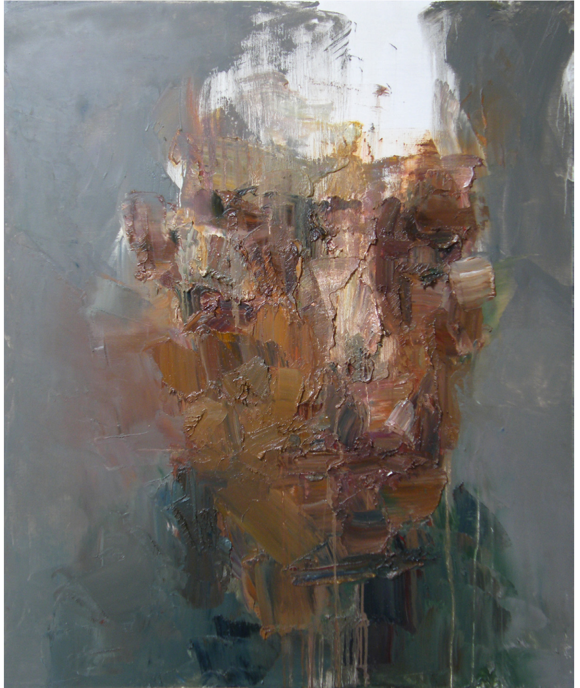
2007 Ruins #6 Oil on canvas 153 w x 185 h cm