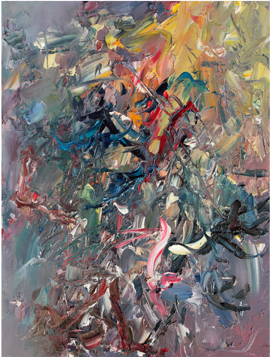
2011 Aurora, Jungle, Blue/Red Bird, Pink Bird, White Flowers, Men Oil on canvas 92.5 w x 122.8 h cm