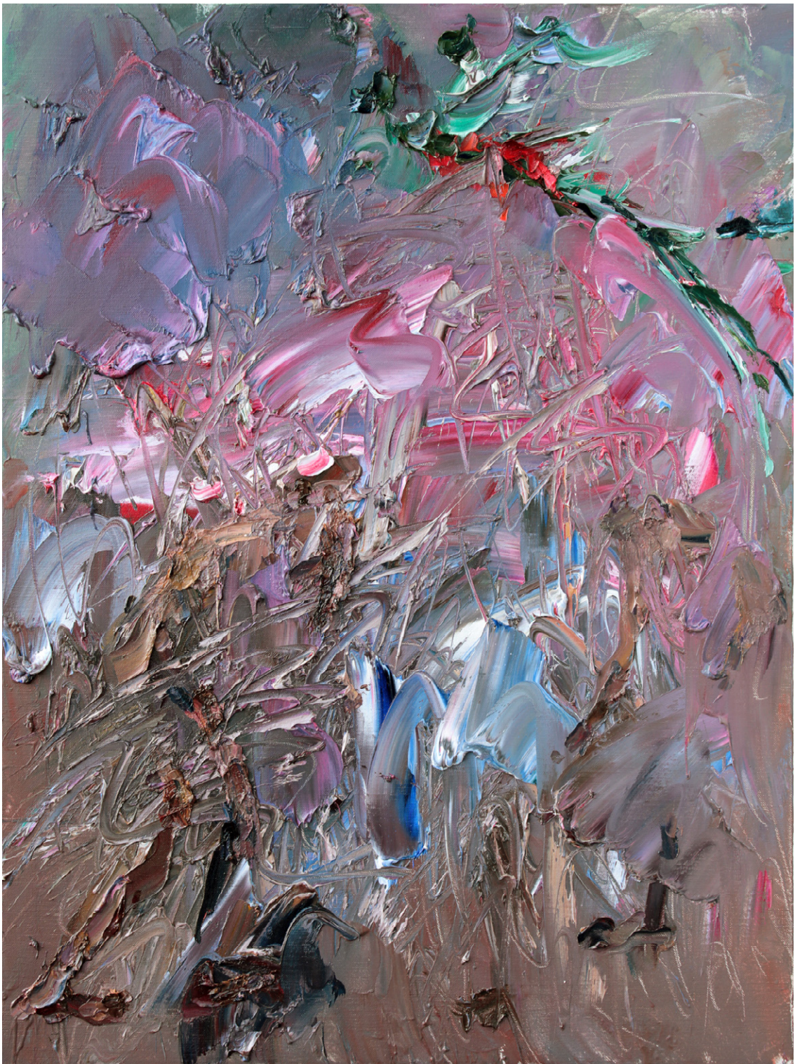
2012 Aurora, Green/Red Bird, Jungle, Men, Oil on canvas 92.5 w × 122.8 h cm