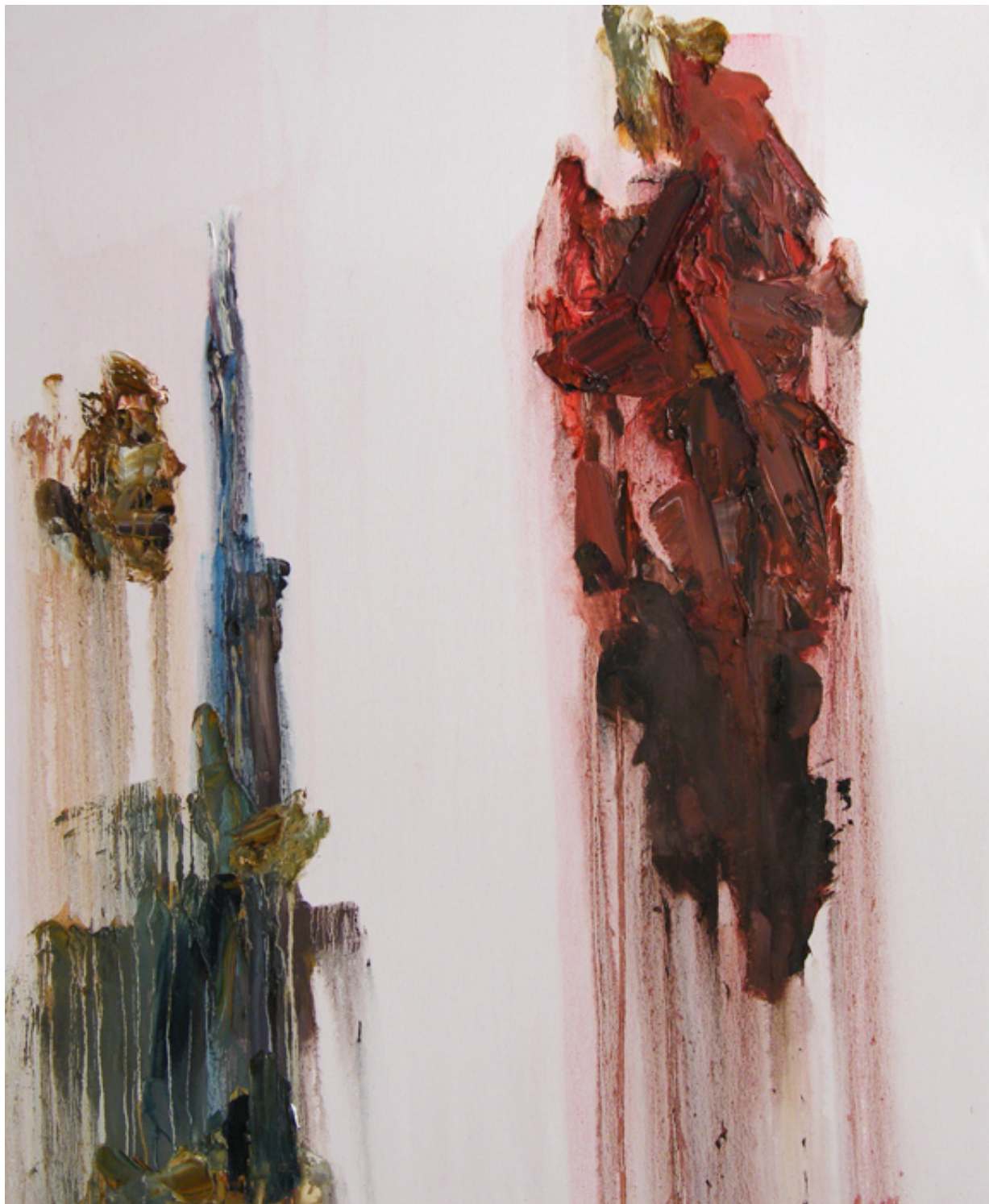
2008 Dalai Lama with Solidier Oil on canvas 153 w x 185 h cm