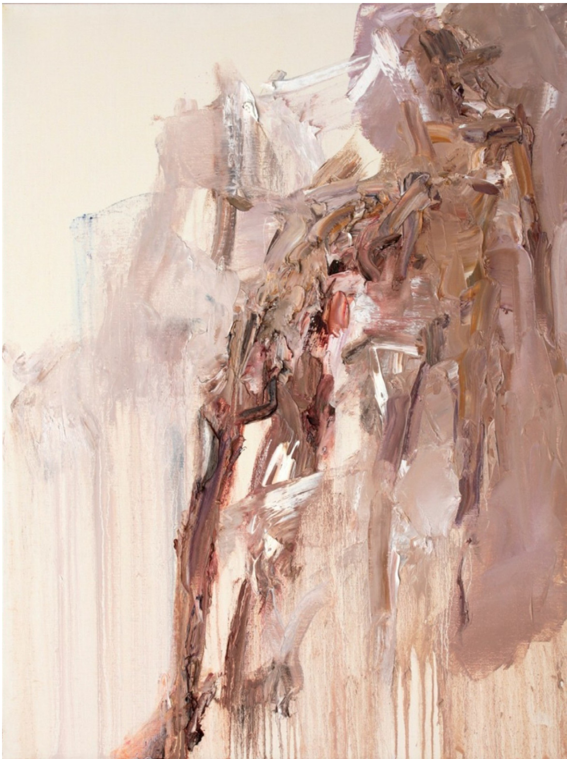
2010 Illusive #1 Oil on canvas 92 w x 122 h cm