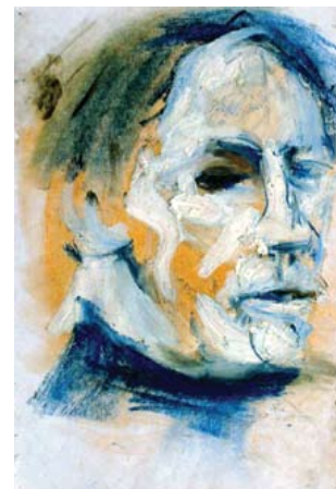
Chen Ping, Study 2 , 1990, oil on paper, 29.7 x 21 cm.

Chen Ping's art is firmly rooted in reality: dreams are not for him, neither is the slick and unrealistic iconography of recent contemporary Chinese art. At the very core of Chen's painting, however, is a subtle but puzzling mystery that demands the viewer's full attention for it is only through close scrutiny of his art that his "messages" are made clear and a fuller understanding of the nature of oil painting is revealed. There are also many intensely lyrical passages to console the disquieted mind's eye. This is as he wishes it for he knows that he needs to create a balance between his vision of violence and humankind's vulnerability and the "increasing sense of spiritual loss that seems to be building around us today." \Delta