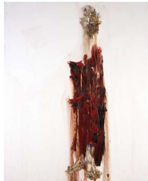
Chen Ping, Man in Red , 2008, oil on canvas, 180 x 150 cm