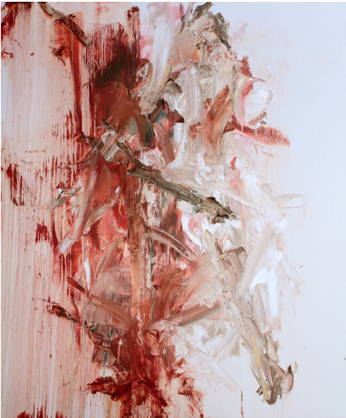
2011 Hand In Red That Reaching Out To Her In White Oil on canvas 153 w x 183 h cm