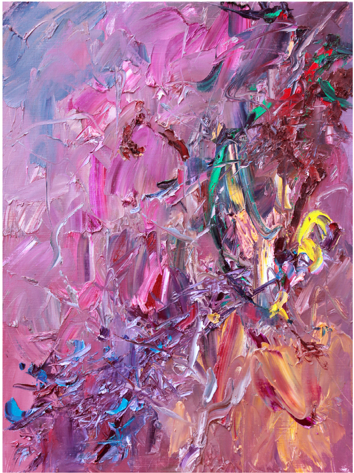
2012 Aurora, Green/Red Bird, Yellow/Blue Bird, Trees, Man Oil on canvas 92.5 w × 122.8 h cm